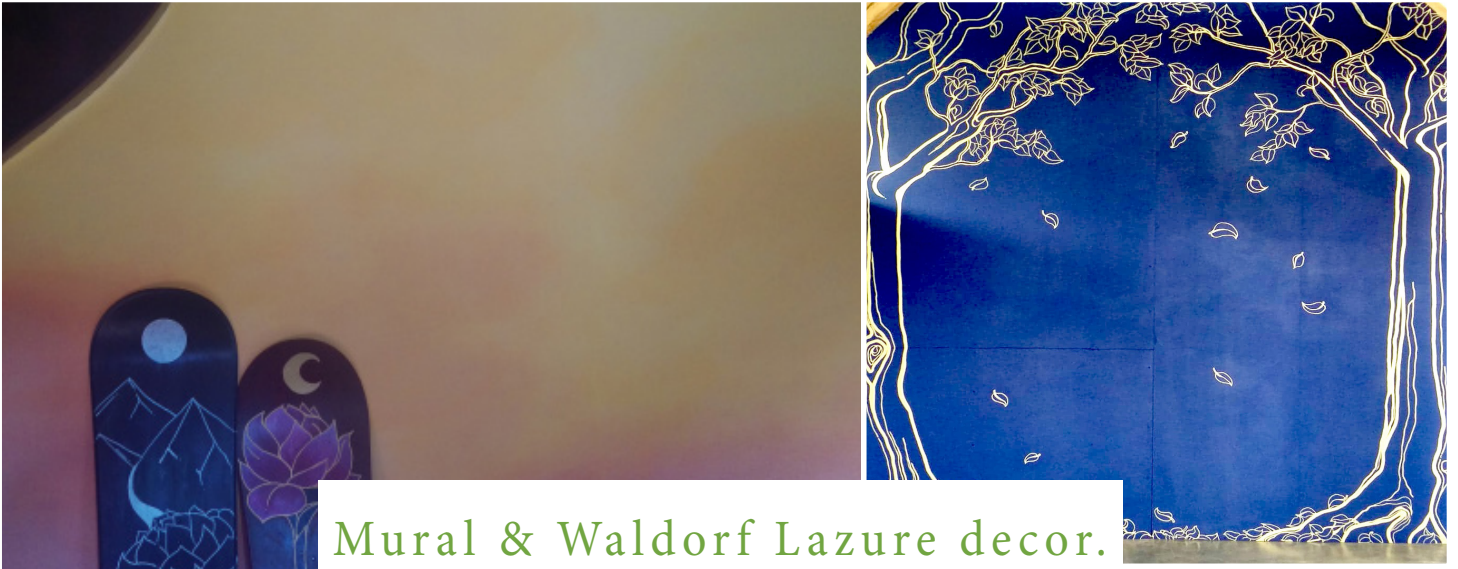
Mural & Waldorf Lazure decor.